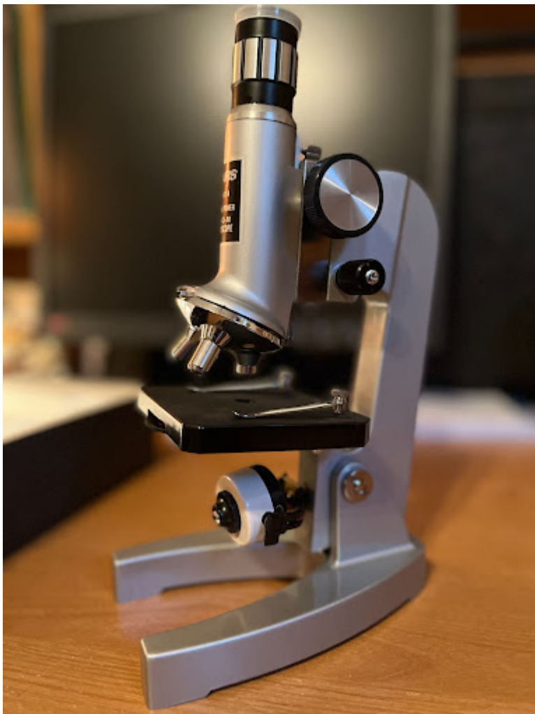
Childhood Microscope from Sears