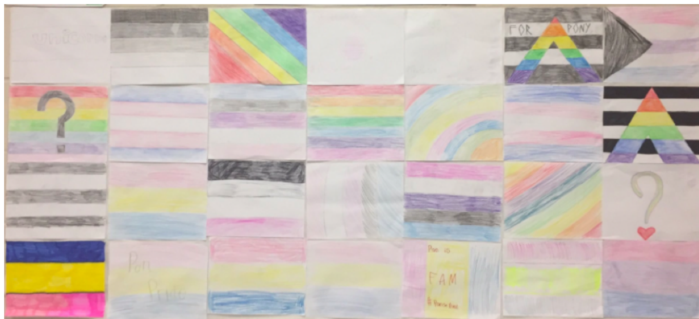
Figure 1. Compilation pride flag colored by GSA students.

Because of the issues the previous year, I took a photo of the finished flag (Figure 1) and sent it to the principal for approval prior to hanging. Once we had that approval, it went up in a large blank space of the math hallway (somewhere we knew all students would pass at some point in their day). Two days later, my colleague and I were asked to meet with the principal during our lunch period. I felt sick to my stomach because I knew what the outcome of that meeting would be—the flag was coming down.