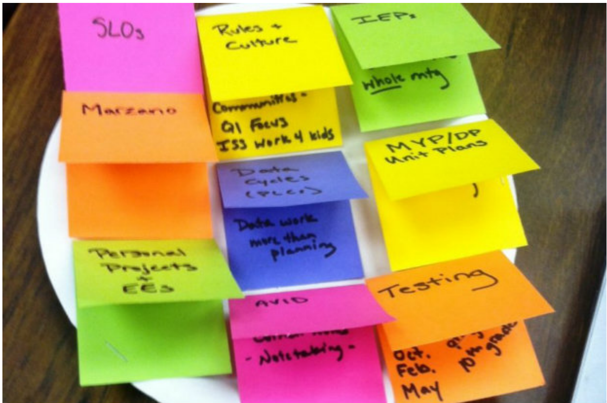
Figure 1: A representative depiction of demands on teacher time.

To represent the demands on teacher time, I took a paper plate and stapled little colorful pieces of paper to the plate. On each piece of paper I wrote a single focus for the year. I meant for this plate to be a creative way to communicate with my department about the many things “on our plate” this year. The plate became a tangible way to discuss threats to morale throughout the year. Each thing on the plate, taken in isolation, is something that could be good for student learning. However, the plate as a whole was so full that each component lost its power. Plus, teachers had little power in choosing what was on the plate, and this lack of autonomy added to overwhelming feelings of discouragement. Morale in my department was crushed by heavy demands on teacher time, coupled with a feeling that teachers’ strengths went unnoticed.