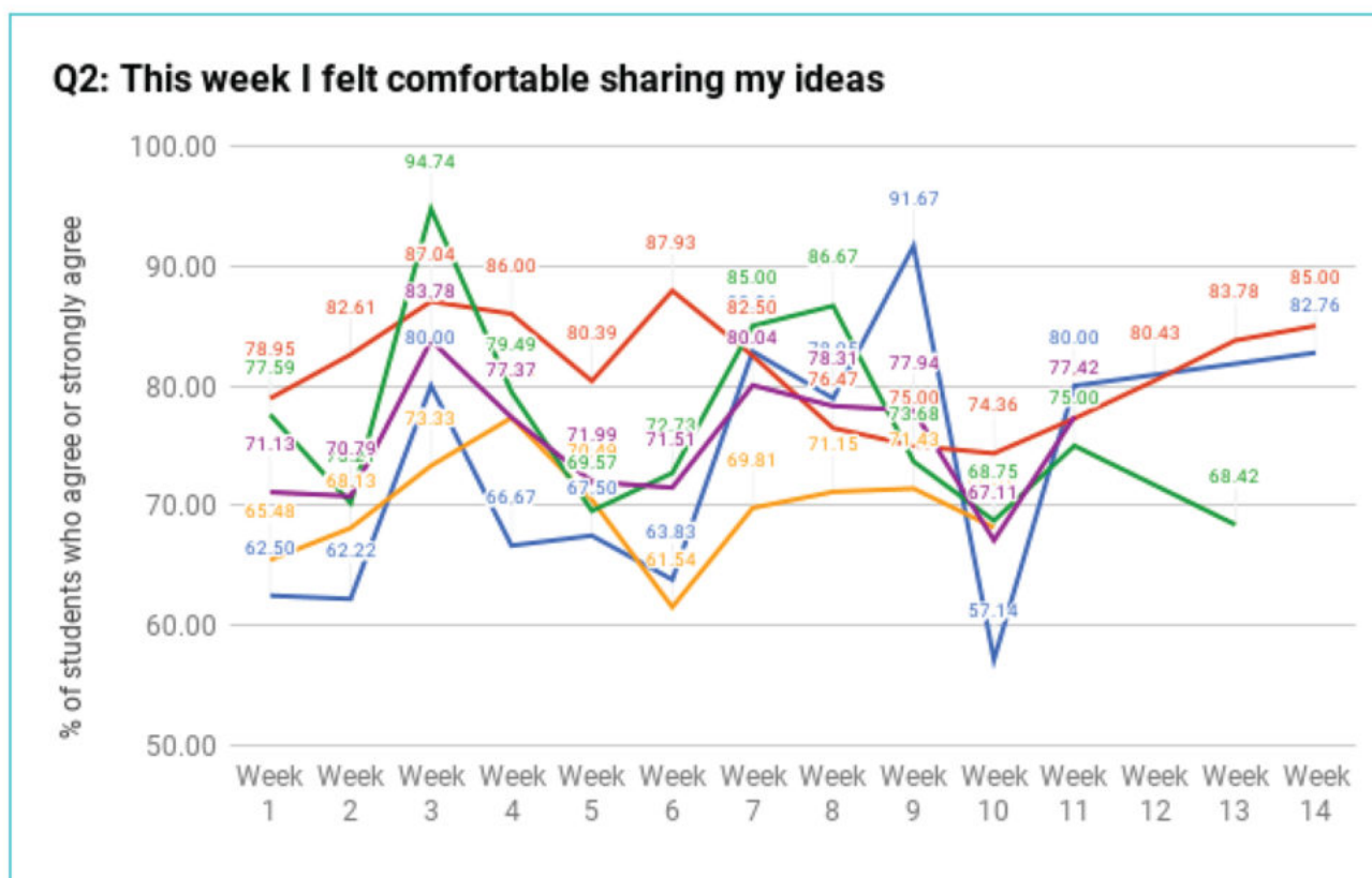
Figure 1. Students' responses to question 2 recorded over 14 weeks. Change in responses to Q2, as shown in Table 1, graphed over the duration of a semester. Each color in the run chart represents data from one teacher.

Note. High Tech High math teachers administered a three-question survey weekly to their students. Students scored aspects of their sense of agency in their math classes using a Likert scale.