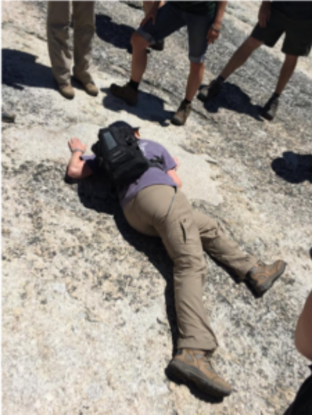
One of the authors getting up close and personal with the rock described in the text.

If you were to make your way through the crowd to see what could be captivating this group of 20 in sun hats and backpacks, you would see a series of semicircular marks etched into the surface of a light grey rock speckled with white, pink, and black crystals (Cathedral Peak Granodiorite). It's a chatter mark, lasting evidence from 20,000 years ago when this peak was 2,000 feet below the Tuolumne Icefields glacier and boulders swept along by sub-glacial rivers left their characteristic impact pattern.