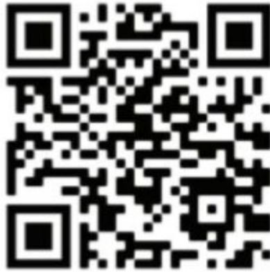
Figure 2. QR code for Physics 4 All: Labs for PhET Simulations

They even helped me make my first QR code so that I could add my “media marketing” badge to my entrepreneur sash (see Figure 2).