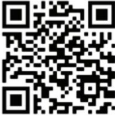
Figure 2. QR code for Physics 4 All: Labs for PhET Simulations

Of course, the journey is not over; after all, a book doesn't sell itself. Now, I am off to conferences, thanks again to the generosity of the Knowles Teacher Initiative. I am happy to report that as of March, interest in my book has grown both through Amazon and on Teachers Pay Teachers. I hope the story of my experience encourages other teacher-authorpreneurs to pursue their own writing and publishing goals. Take a weekend, even a personal day, to map out the steps you need to take and reach out to your own professional community for support. Will it be easy? No. But will it be worth it? Yes.